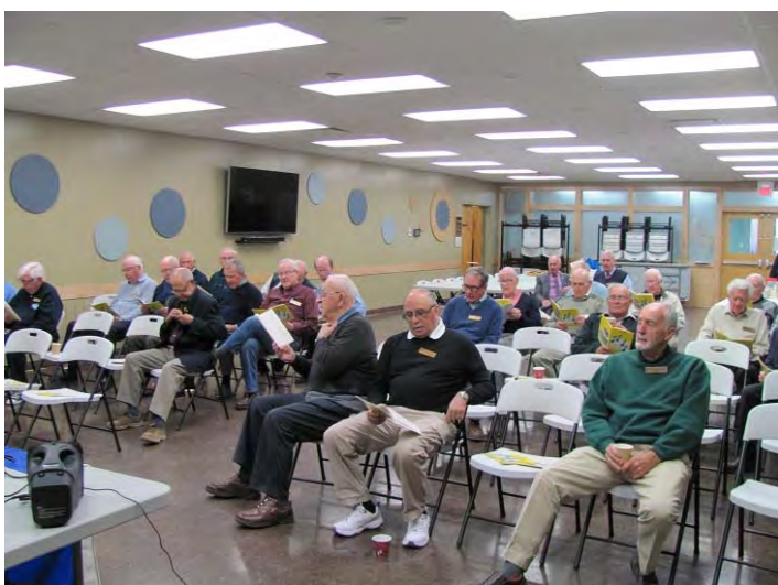
Some of the members during the sing along