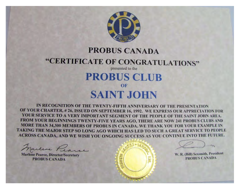
PROBUS Canada, Certificate of Congratulations to the PROBUS CLUB of Saint John, on the 25<sup>th</sup> Anniversary.