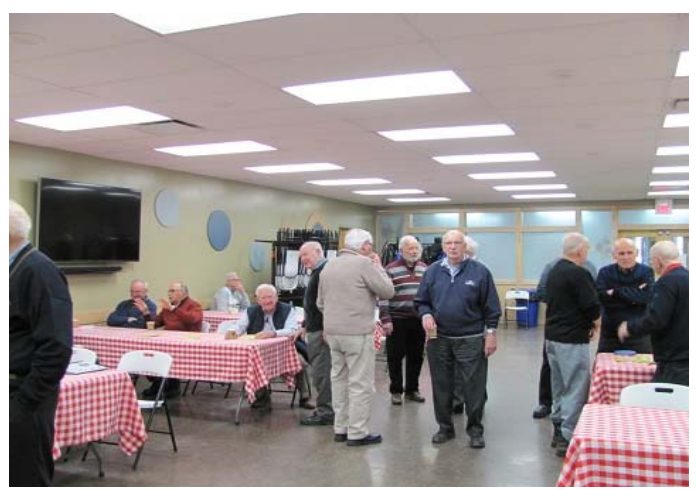
Coffee break time and time to catch up on the news.

With 4 new members welcomed in January, it has been suggested that all regular members introduce themselves to the new members and make them feel welcome.