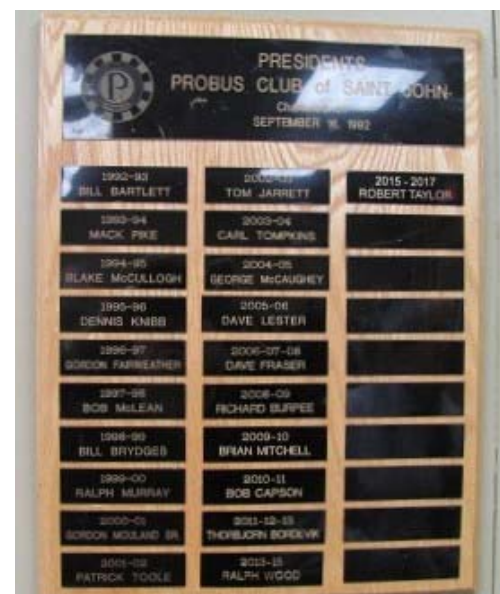
The plaque with past Presidents of Probus Club has been updated to 2017. It is located on the back wall.

A different commentary this month or some education on someone from many years ago with the same name as our " PROBUS ".