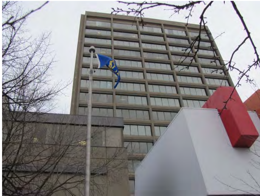
The flag as seen at City Hall in Saint John NB