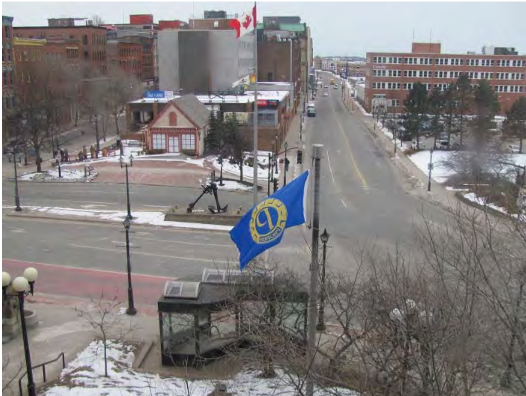
This is the view at the foot of King St. as seen for the 3 rd floor of City Hall building