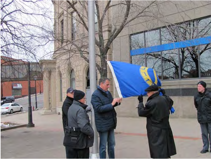
Mayor Don Darling attaches the flag to the pulley system

Our Saint John Mayor DON DARLING , was present with 8 members of the men's group. It was a breezy day with the temperatures around -10 which felt like -20 C. In no time at all, it was flying. We then retreated to a cup of hot coffee inside. The flag was retrieved about 10 days later.