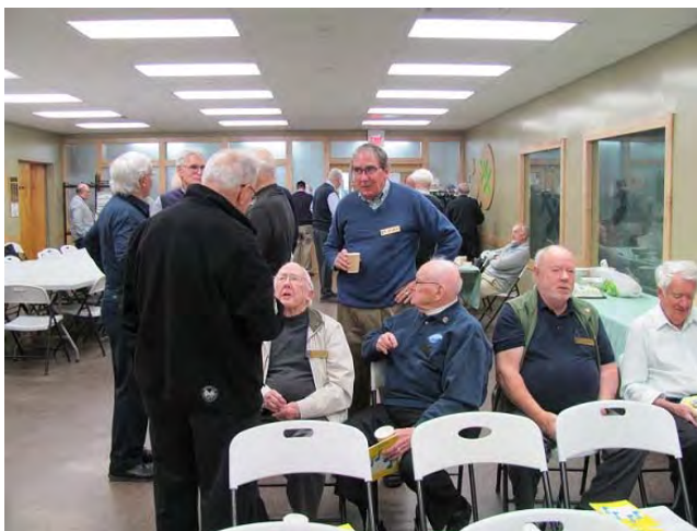
Some members engaged in conversation during the coffee breaks.