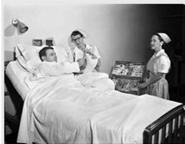
Buying cigarettes at the bedside 1950s.