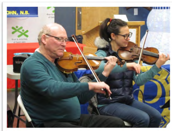
Intense concentration is obvious.