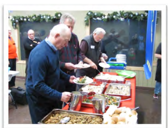
39 Probus members lined up for a full course meal of Turkey with apple or pumpkin pie for desert.