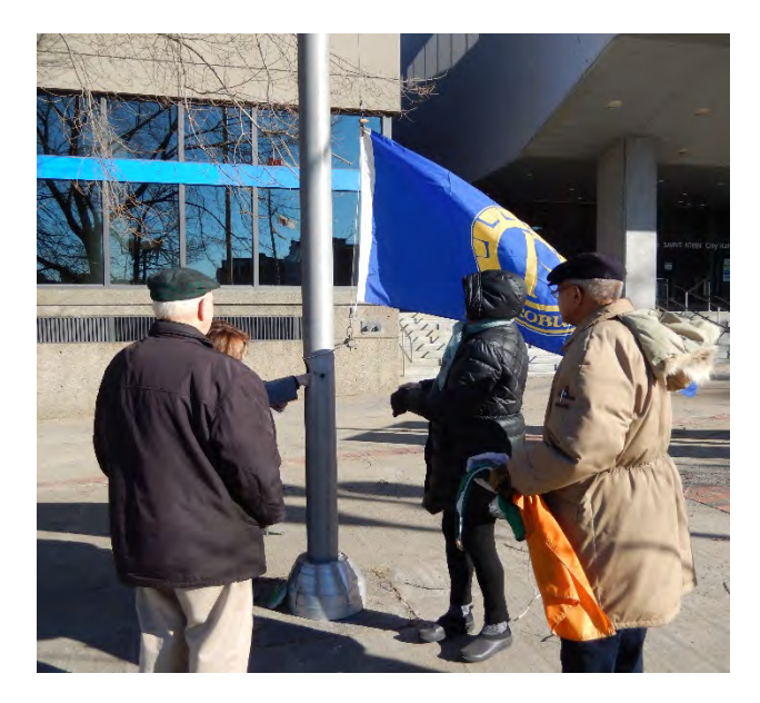
The flag being raised by the group