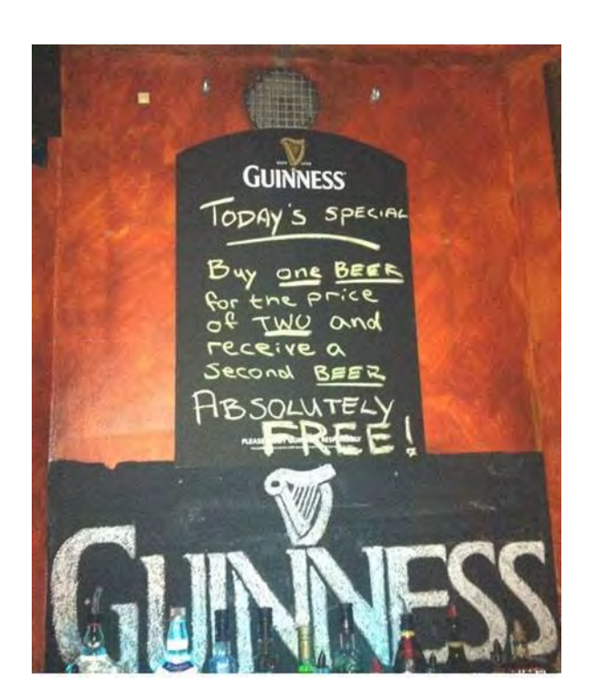
Now this is a bargain, don't you think?