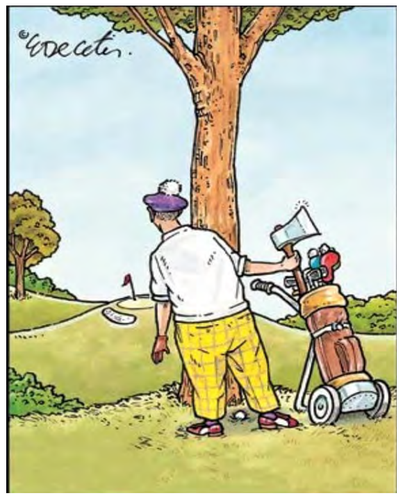
Would you do this?