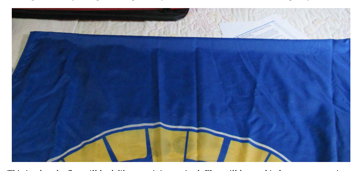
This is what the flag will look like once it is repaired. Flag will be used indoor at out meetings.