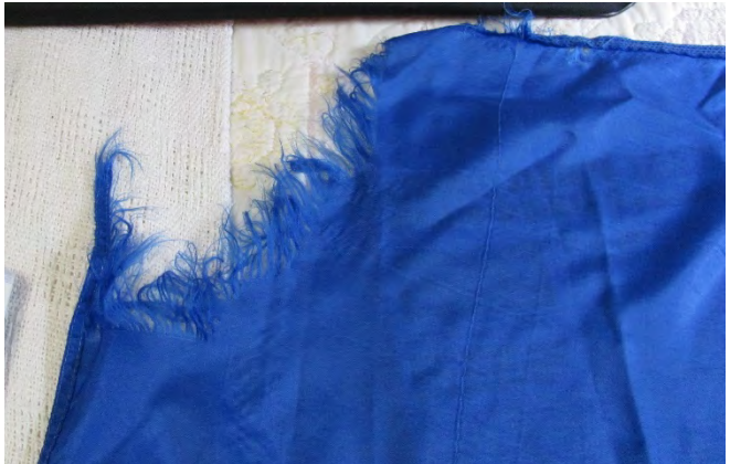
Damage on the left & right sides, probably due to the winter storms over the past year.