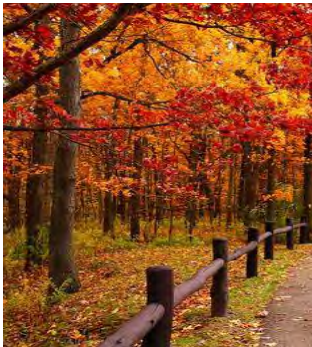
Everyone's favourite time of the year