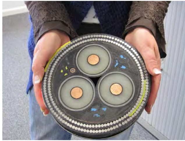
Rogers Cable connection? Actual cross section of an under-sea cable