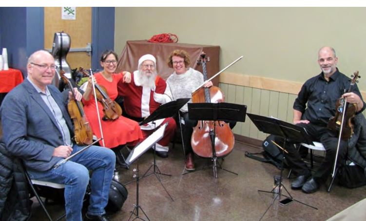
The Saint John String Quartet provided the entertainment.