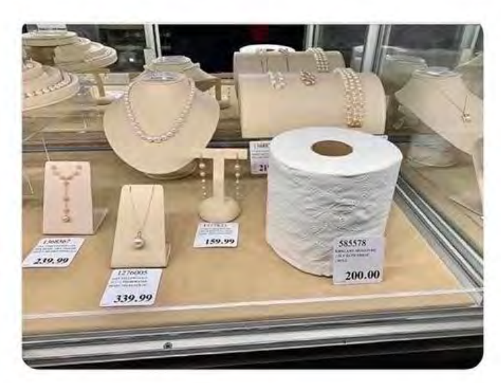
Note the price of a single roll of toilet paper.