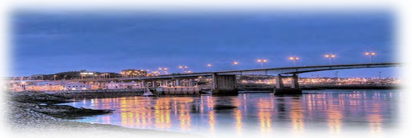
Saint John Harbour Bridge at night.

As our president of PROBUS Canada states “ Be a friend...Bring a friend ”