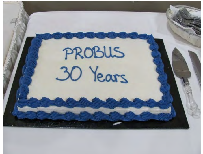
A large cake was displayed before being served to members in recognition of the up-coming Anniversary of PROBUS 30 years.