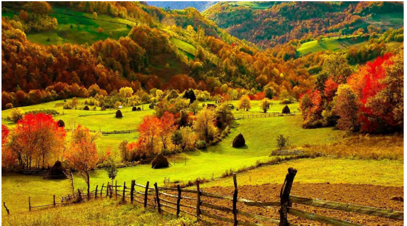
FALL SCENE -- New Brunswick