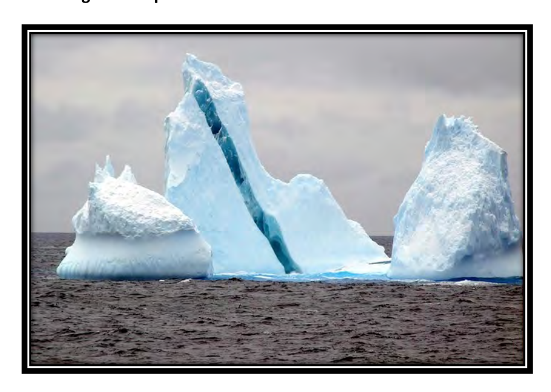
Frozen Wave Pixs - Nature is amazing! The water froze the instant the wave broke through the

When an iceberg falls into the lake, a layer of water can freeze to the underside. If this is rich in algae, it can form a green stripe.