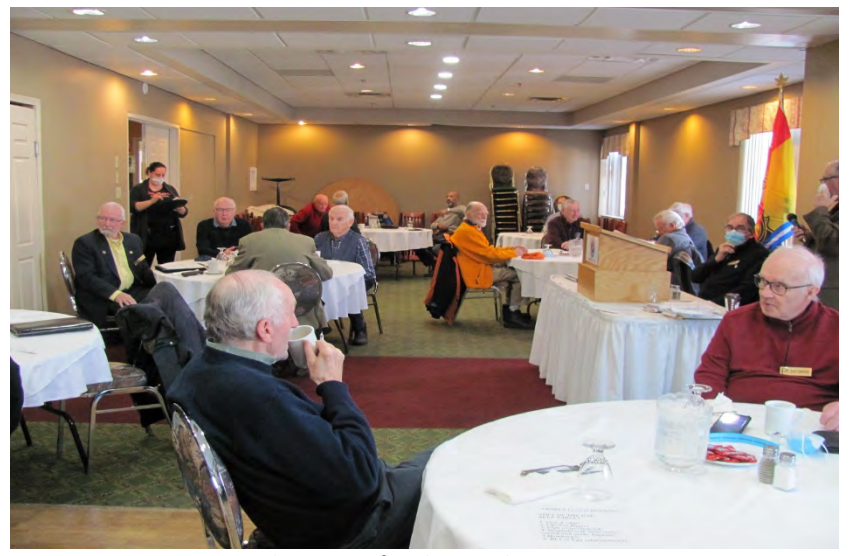
Members wait for the meals to arrive.