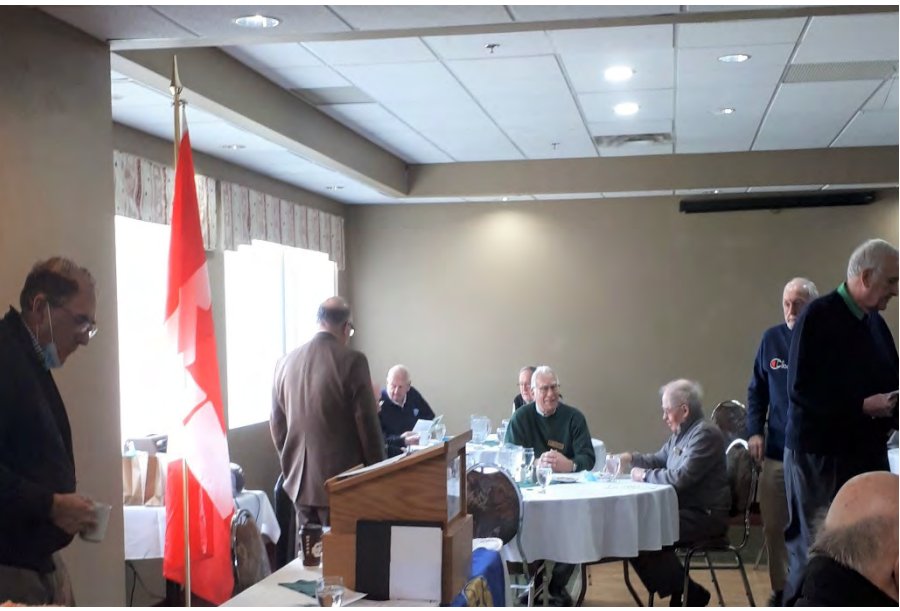
Coffee time, conversations, meeting members that you may not have seen in a while. That is what PROBUS is all about