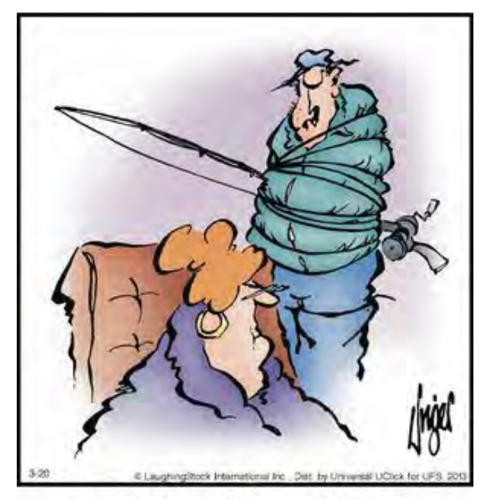
"I hooked a real big one but it kept swimming around the boat."

Priest: You're probably right. Get up and get your own blanket!!!