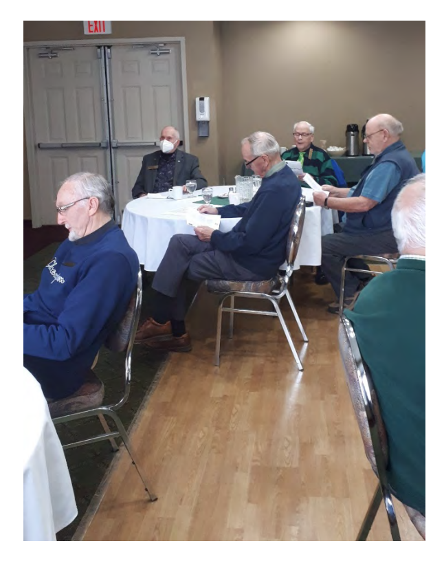
Members listing to the music.