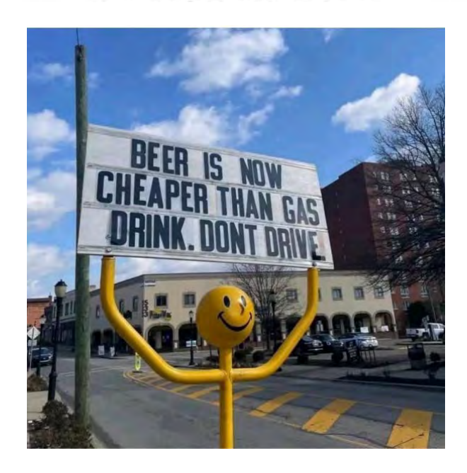
This is true!