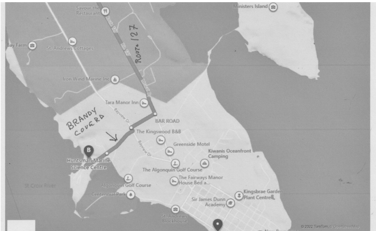
A Saint John, New Brunswick