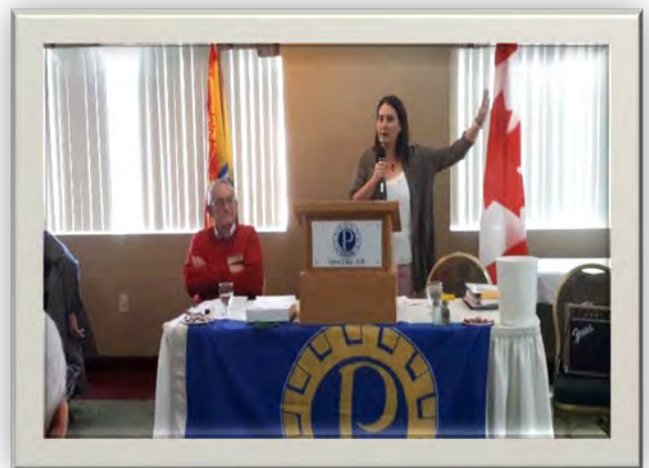
Our Guest speaker during her presentation.