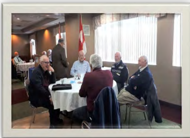
Members enjoying conversations prior to the meeting.