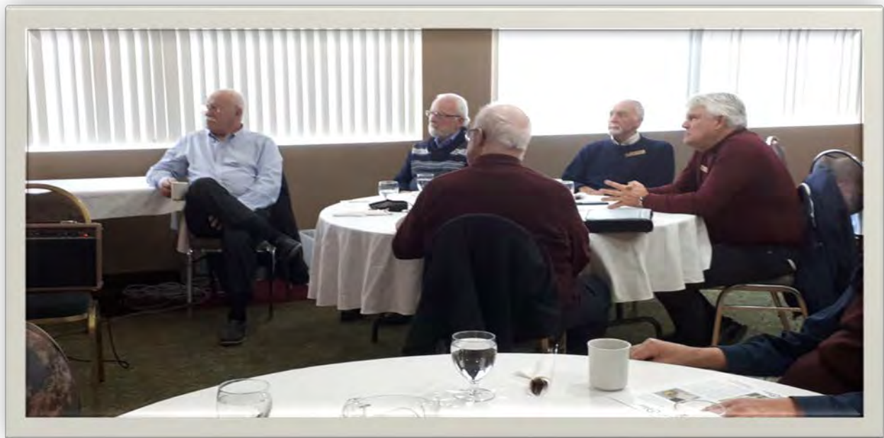
Members intently listening to the presentation that is going on.