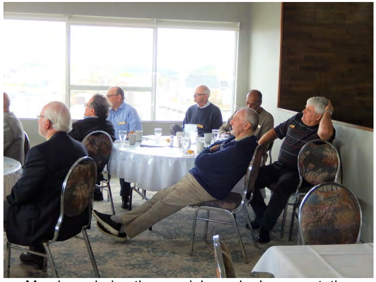
Members during the special speaker's presentation.