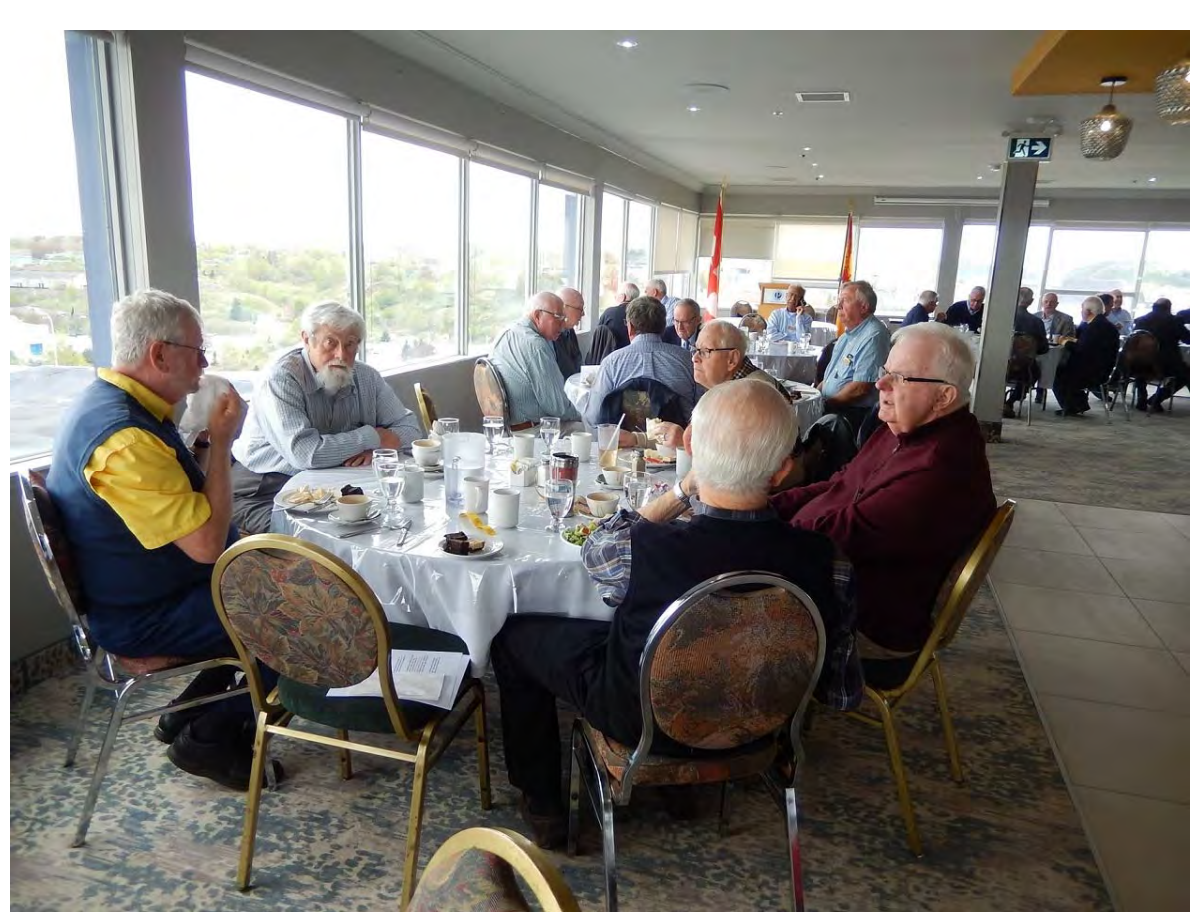
Part of the group of 24 that stayed for a good meal.