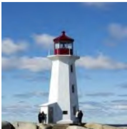
Saint John, NB - CANADA

CELEBRATING 30 YEARS AS A PROBUS CLUB SAINT JOHN N.B. September Edition Volume 30--#1