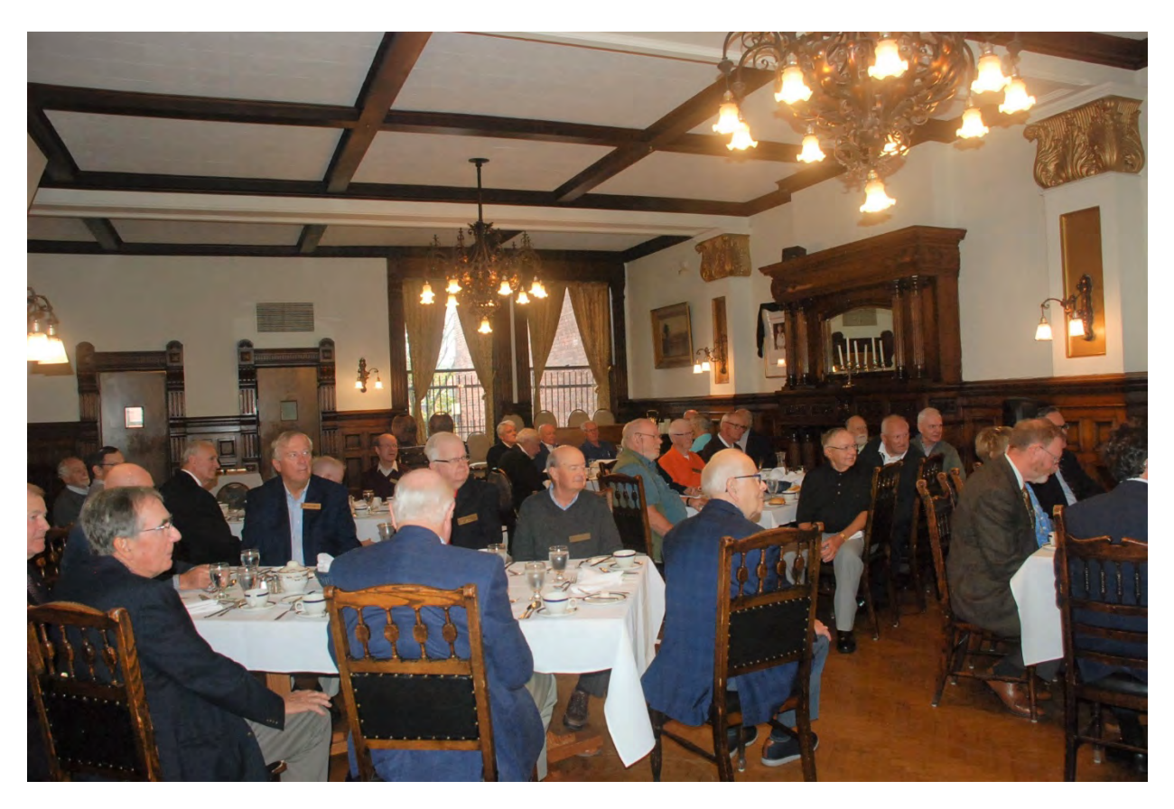
Forty-four members listening to the speakers. First time back for some members due to COVID.