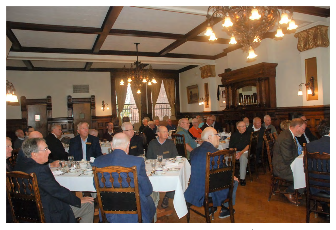
Membership looking on, at the start of the special 30<sup>th</sup> meeting.