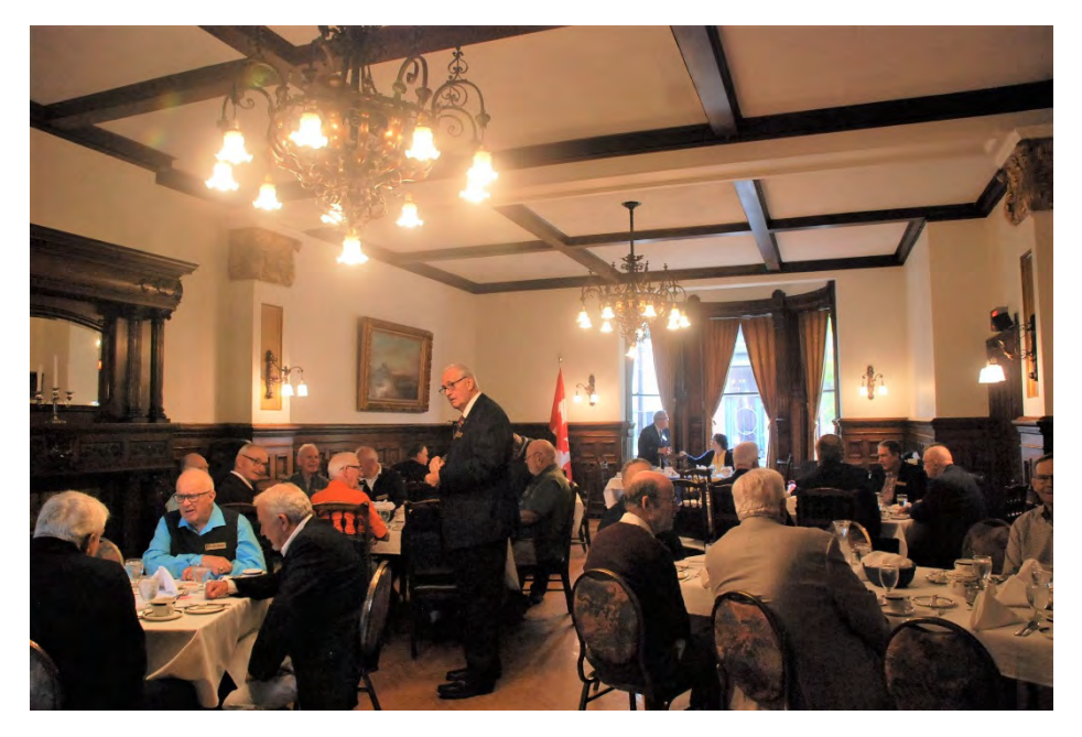
Members seated prior to the start of the meeting.