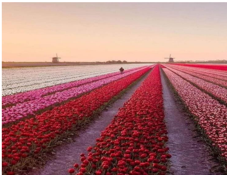
Once a year—Tulips is Bloom--Holland