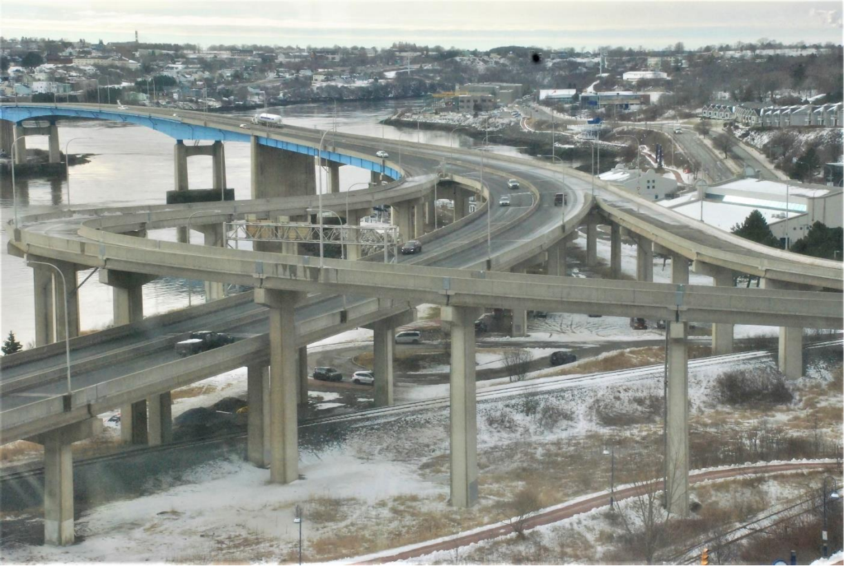
This is a distracting view from the 8th floor of our meeting location. It is the entrance of the Harbour Bridge. Very little snow for February.