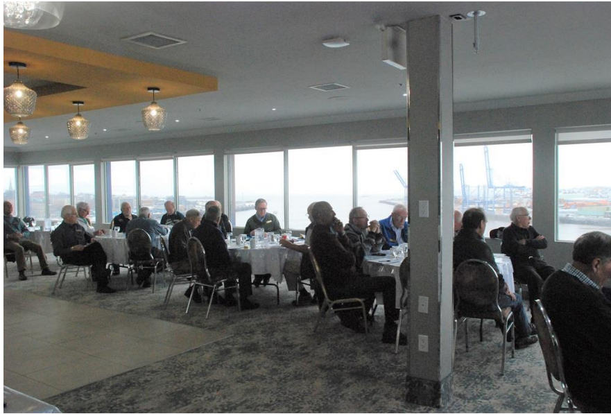
View of the 32 members present at the meeting.