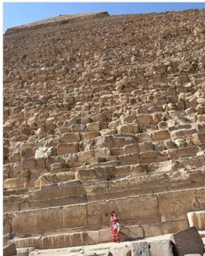
course. These structures are huge! This is Khafre's pyramid, the second largest on the Giza plateau. Yes, there's another one even bigger than this! Jaw-dropping!

As we all know by now, a major earthquake struck Turkey-Syria on February 16/23. This picture shows the extent of the damage that occurred outside the city. This land was level prior to the quake and see the difference after, pure solid rock fractured like puddy . In the picture on the left, you will see people standing at the edge of the cliff and are hardly visible. The picture on the right has been enlarged to show these people. This shows the power of nature.