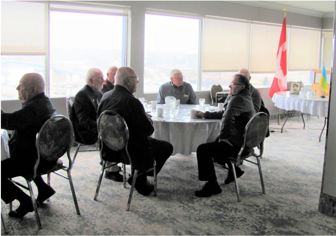
PROBUS members getting to know each better prior to meeting.