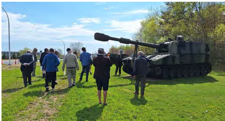
The three tanks show are at the entrance the main gate. Our tour guide gave a fantastic description of each.