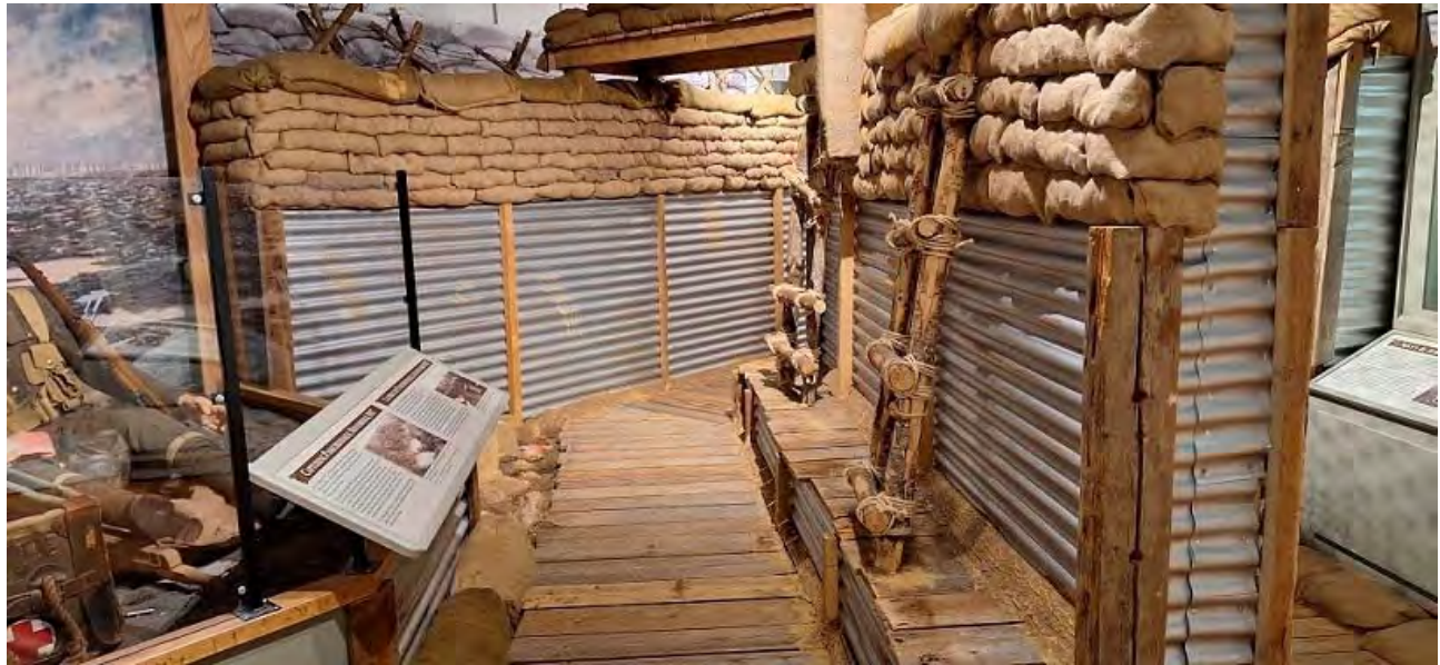
A display of a command trench during the First War 1914-1919.