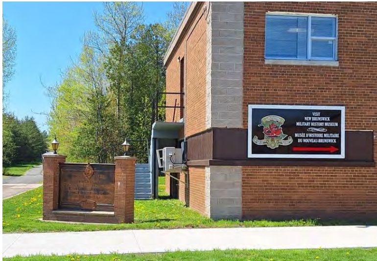
This is the entrance to the New Brunswick History Museum.