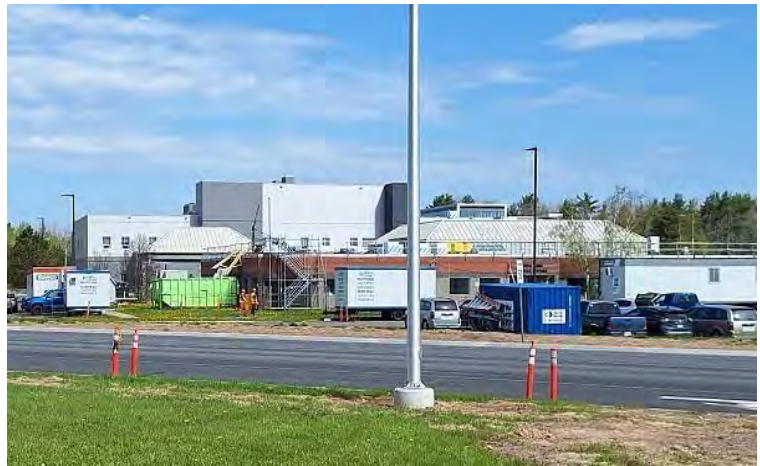
View of the Base Hospital