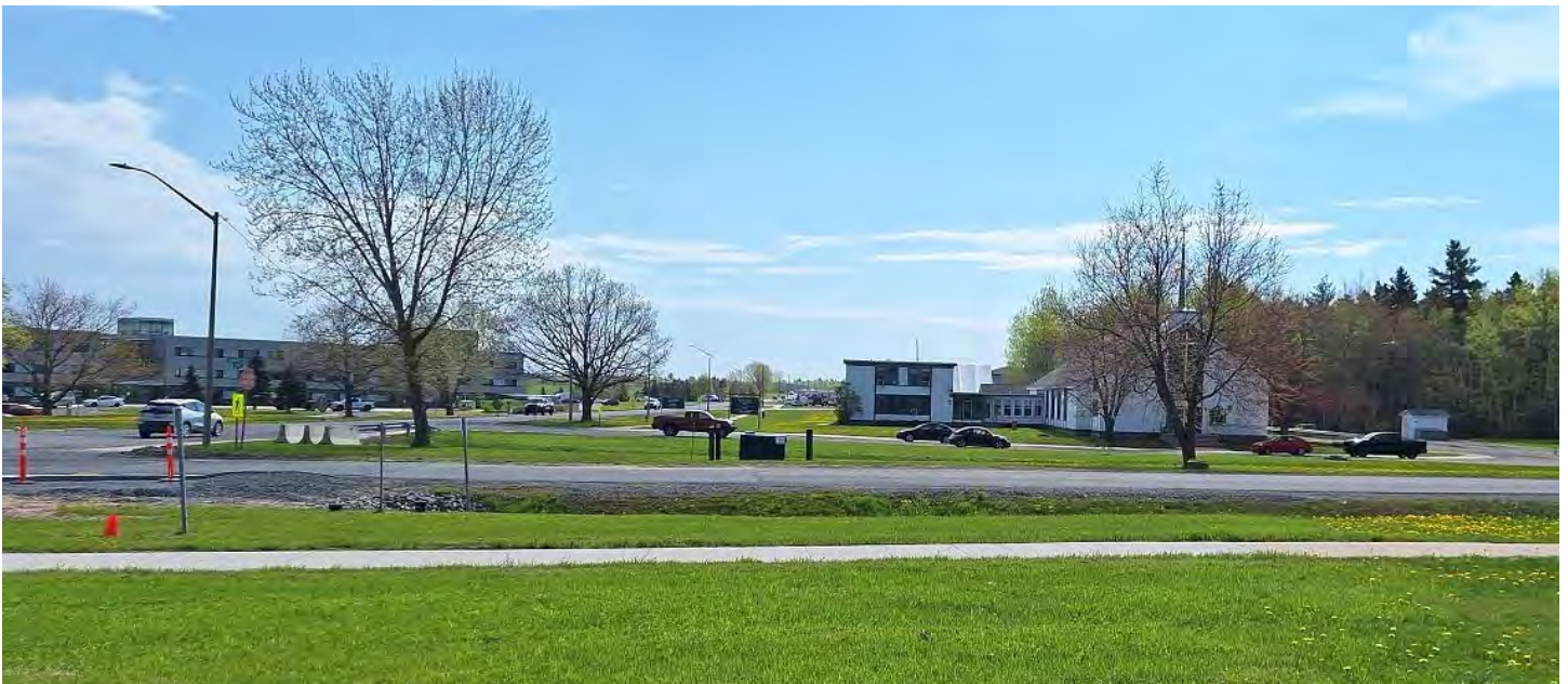
Administration building on the left with a Chapel on the right.