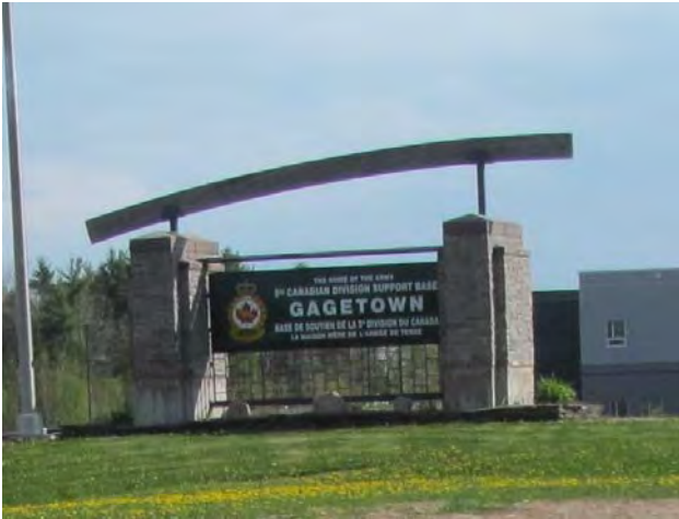
Entrance to Base Gagetown

Here are a few pictures taken of the base Gagetown Military Base in May of 2024. In August I hope to add most of the pictures taken that day. I can not identify all the equipment shown but I am sure some will recognize certain vehicles/tanks/equipment.