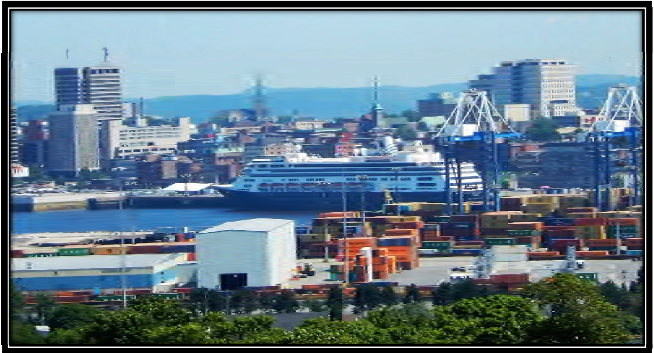
A view of the Saint John Harbour with the second cruise ship of the season.

Just a note for all, see the past information on your club from years ago. You could be surprised how some things have changed.