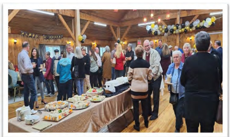
A very well attended function for sure.