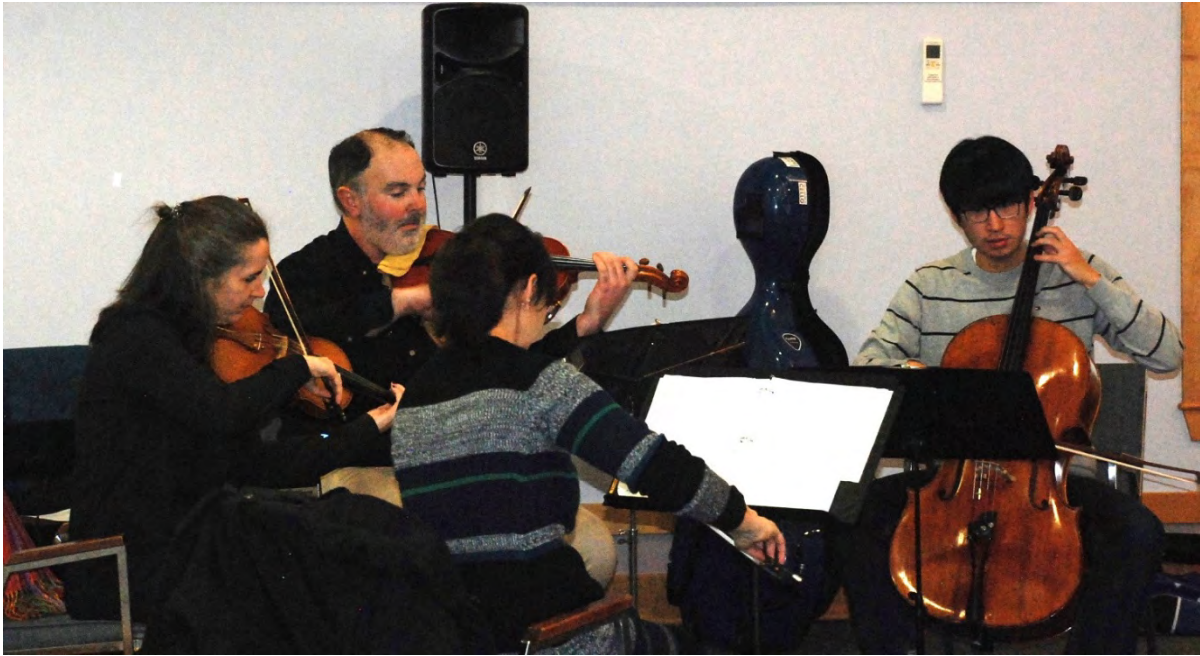
Very intense while playing. Nicely done.

The police just pulled me over and said “Papers?”