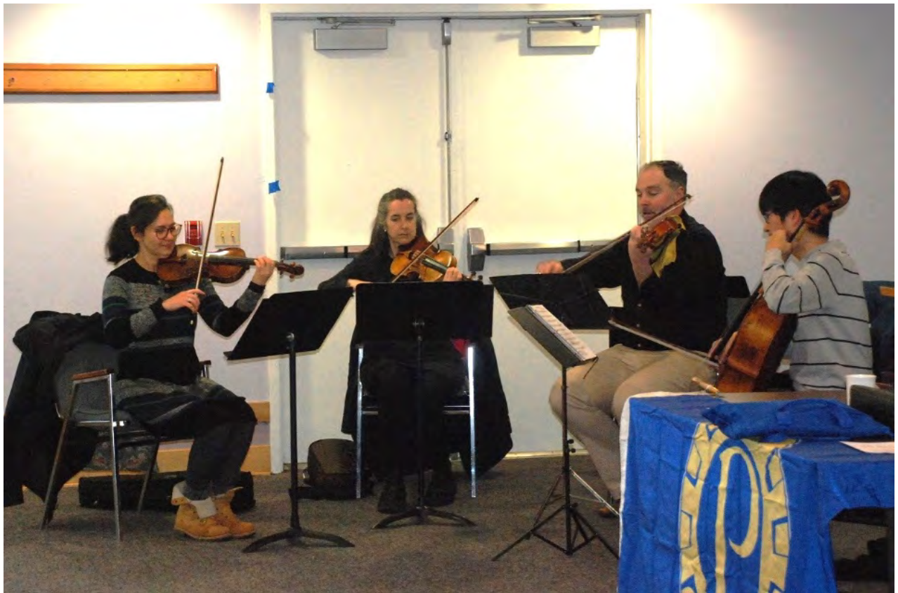
Saint John String Quartet.