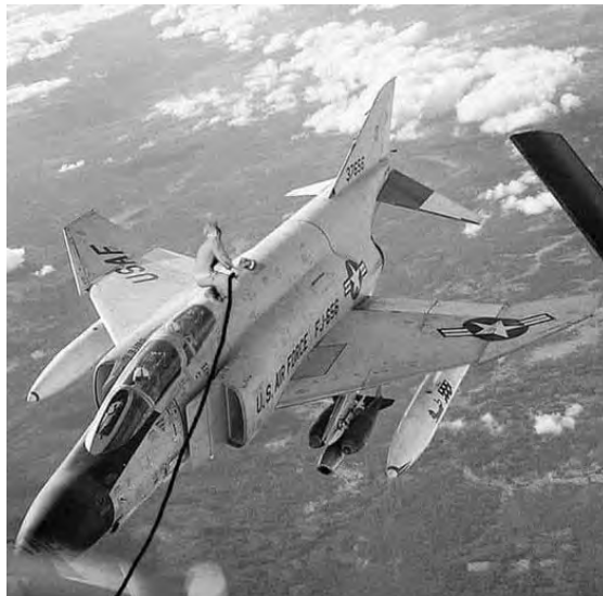
Most Dangerous job in the world!