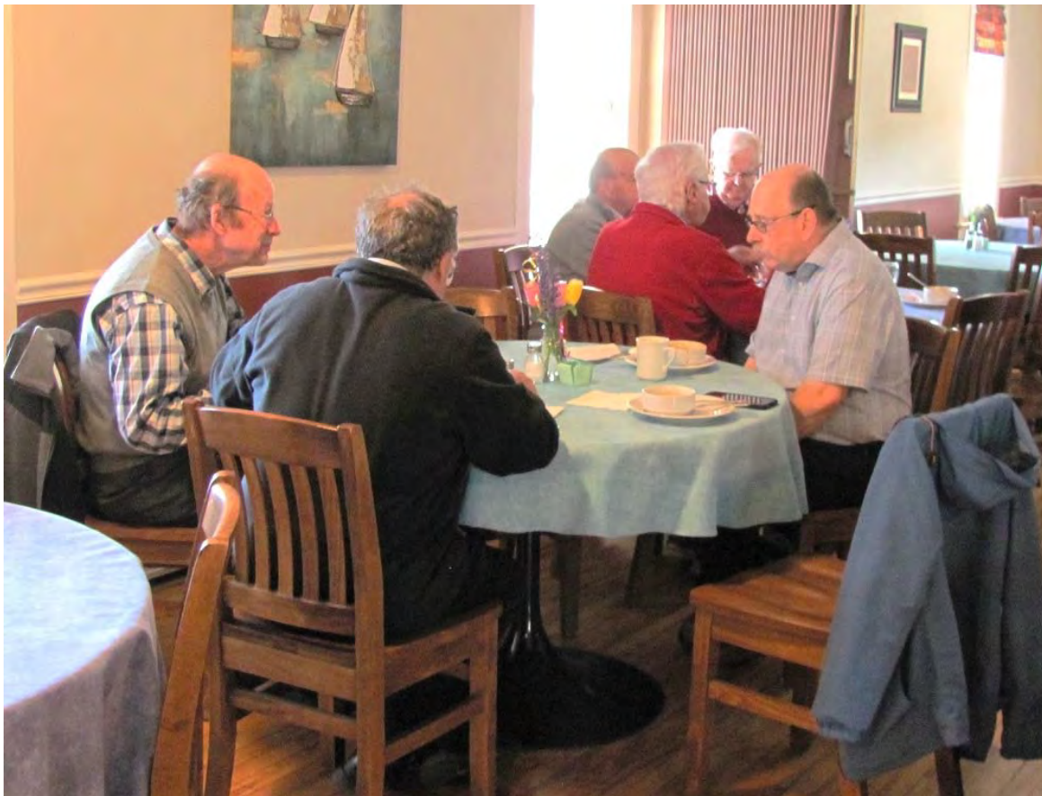
Members enjoy their lunch.