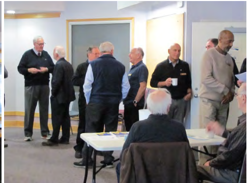
PROBUS members gather around for coffee and news from each other.