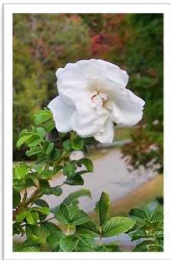
Last ROSE of the season.