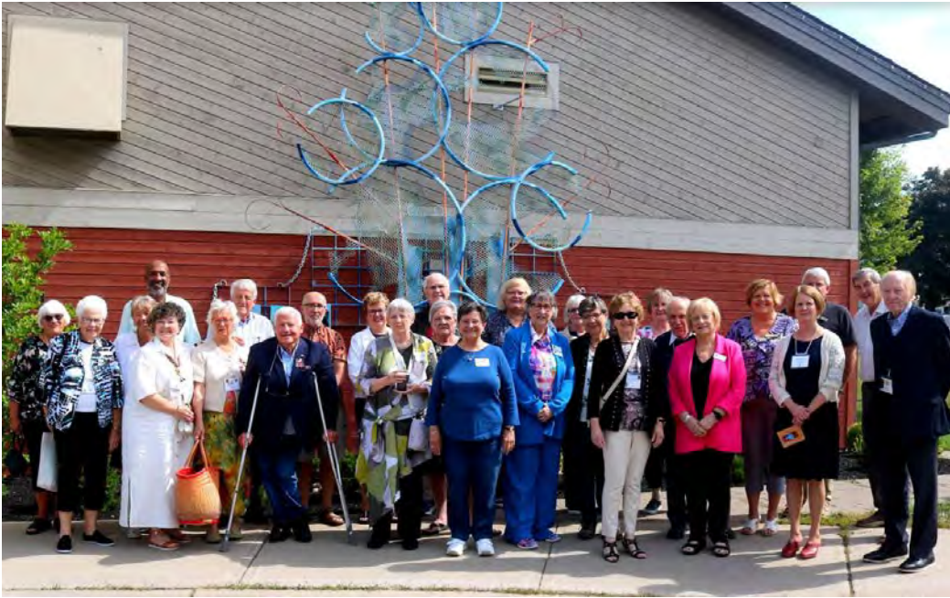
Group photo from the meeting at Shediac, NB.