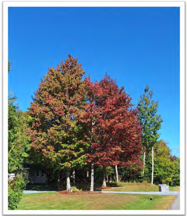
Same tree, 10 days later.