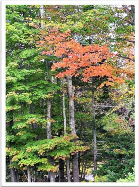
Maple tree foliage.