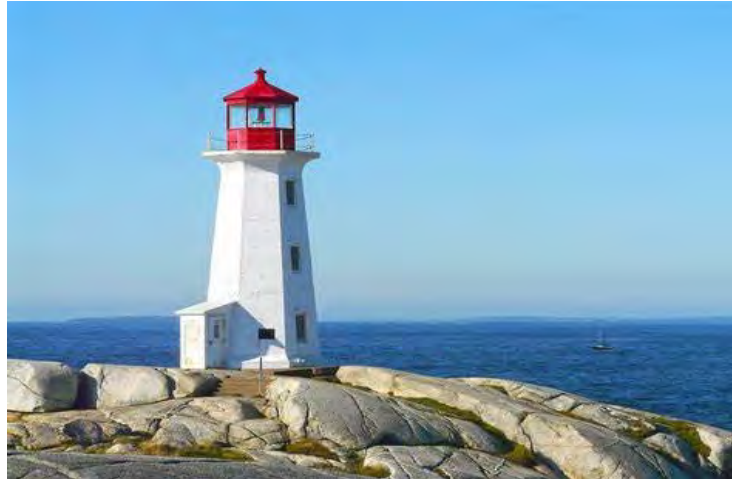
PEGGY'S COVE LIGHT HOUSE, Nova Scotia