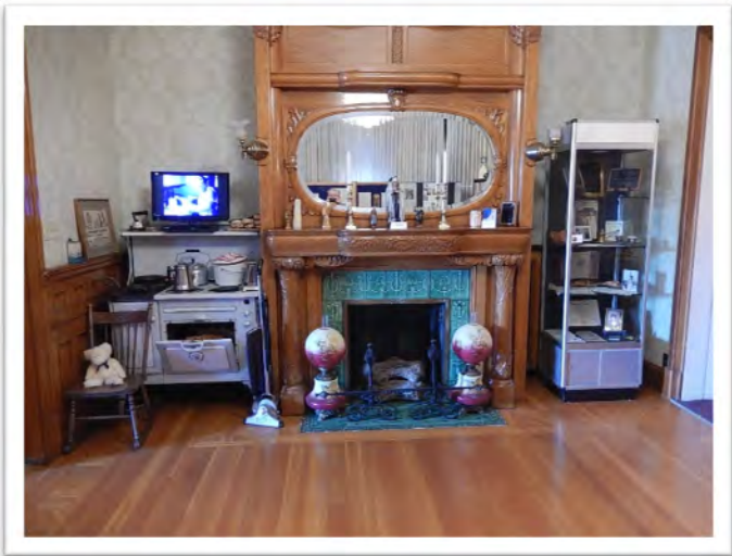
These are some of the rooms with period displays of material used in the Jewish faith, some from many years ago.