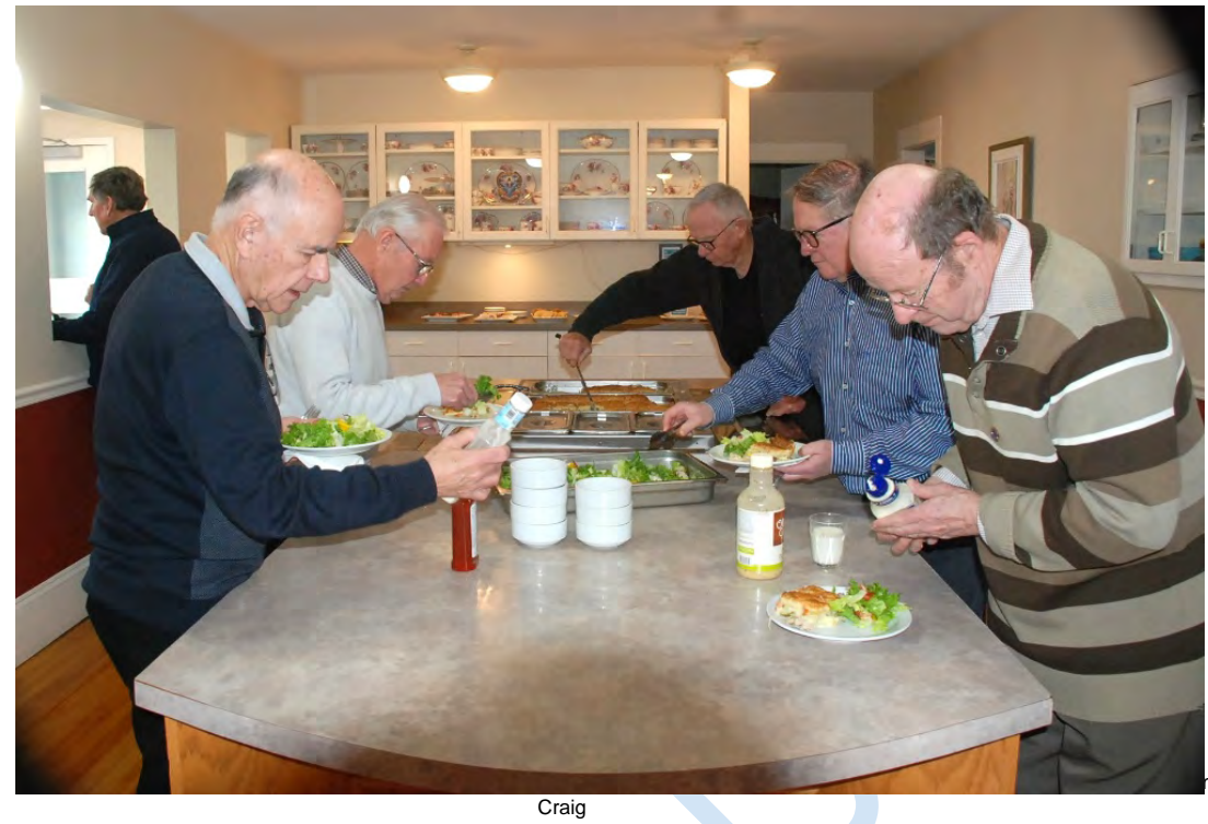
mages by Tom