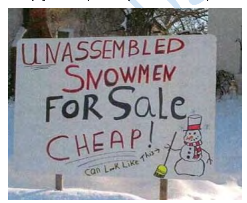
270 sold so far!

Bumper Sticker-I'm not drunk, I'm avoiding potholes