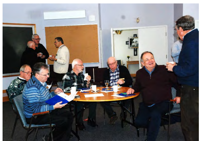
Members gather around the table for coffee and conversation