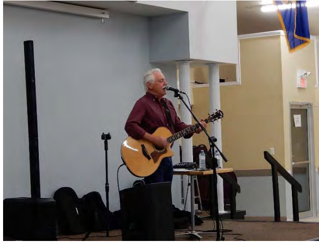
Entertainment after the meal.