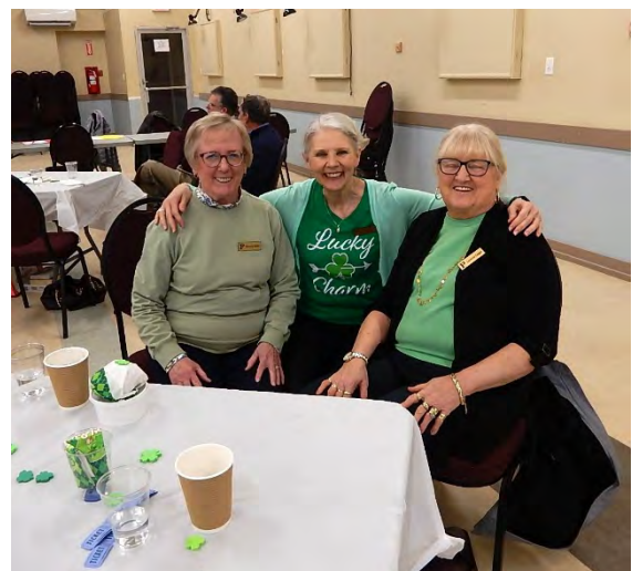
My new best ladies friends