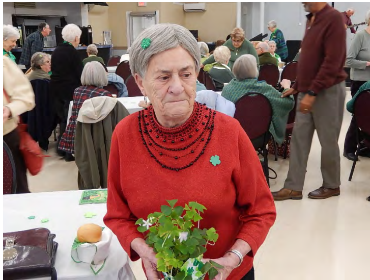
This PROBUS lady won one of the door prizes.