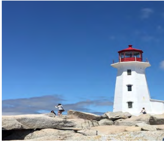
Lighthouse at Peggy's Cove, Nova Scotia.