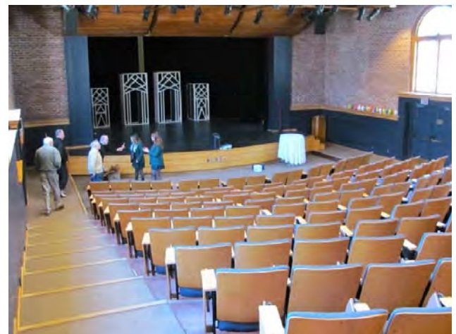
This is the entrance of the Susan B. Ganong Theatre with a view of the stage and seating. Plays are performed frequently.