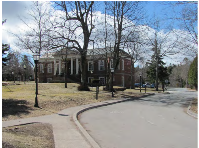
Impressive architecture on this building .