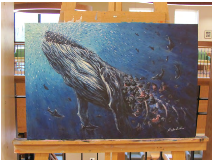
This is one of the Drawings performed by a student,impressive. . tour.