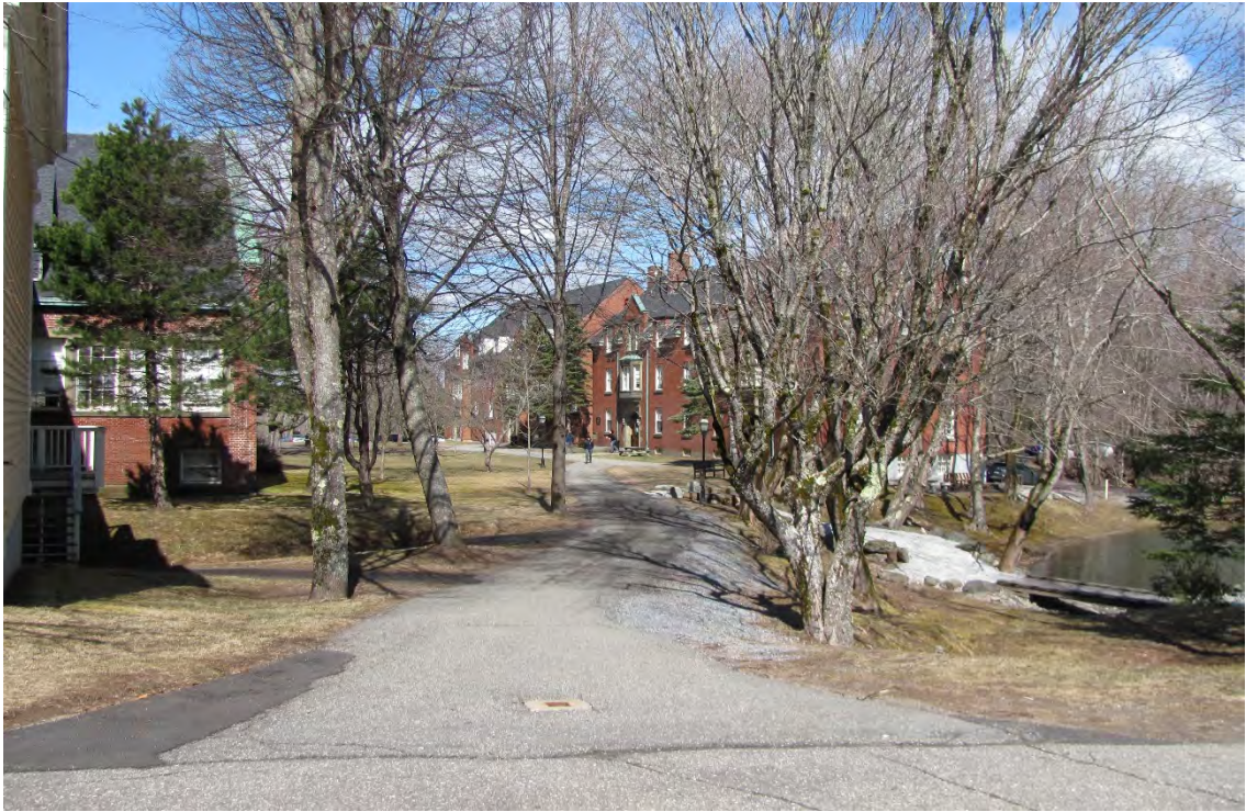
A view of the many buildings. Natural beauty.