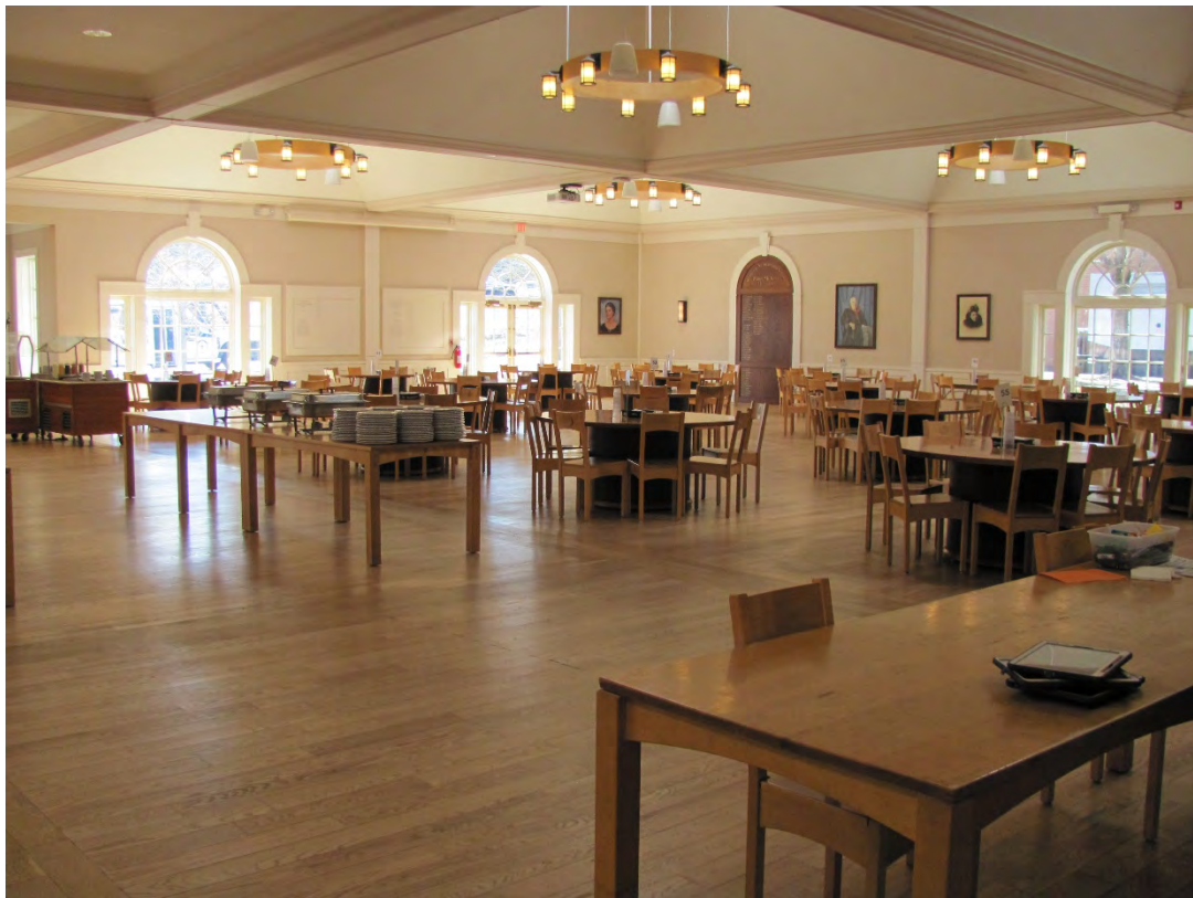
This is a view of the very large cafeteria. This is only one half! On the left, a piano is located, and many students play during the day.