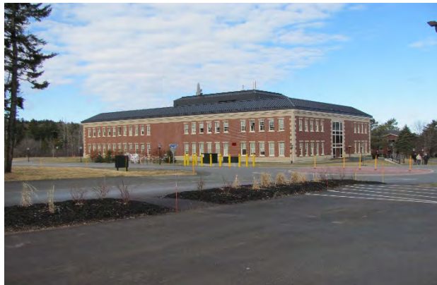
The newest building in the background, the “ Science Hall ”

As you may recall we had a tour/meeting at the RNS complex in April. Here are a few pictures of that event. I believe the turnout was good at 28 PROBUS members.