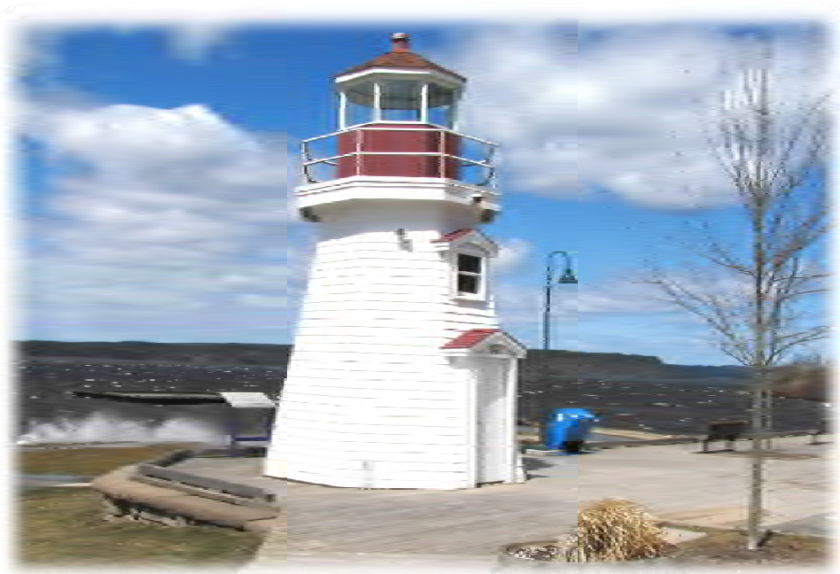
Lighthouse at Renforth, Rothesay N.B.