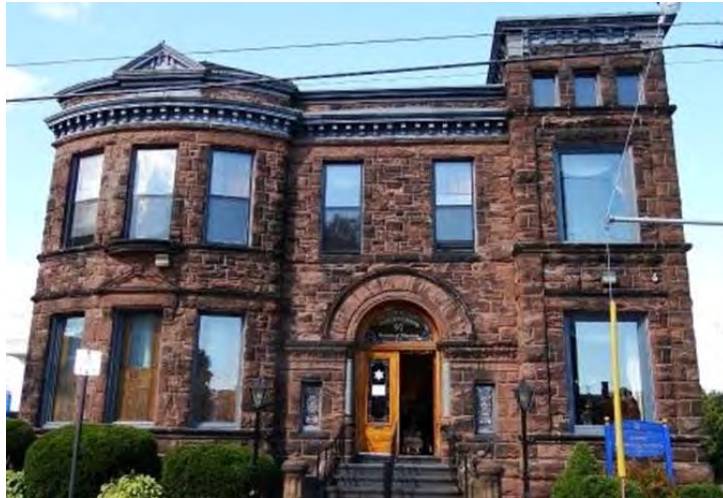
Front view of the Jewish Museum