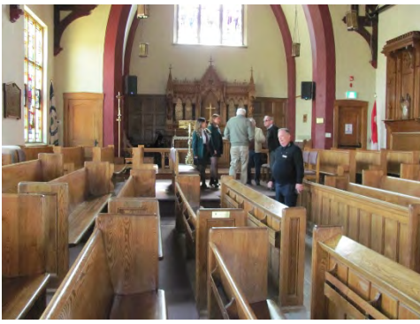
A view inside of the church. windows.