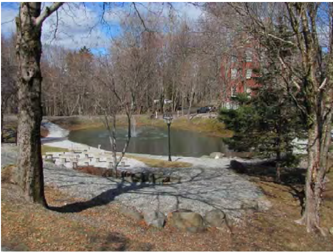
A relaxing pond of water has come to life with the warmer weather.