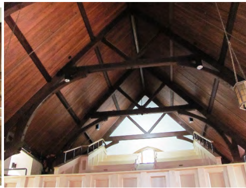
The support structure for the roof was taken from the wooden vessels of days gone by but “inverted”